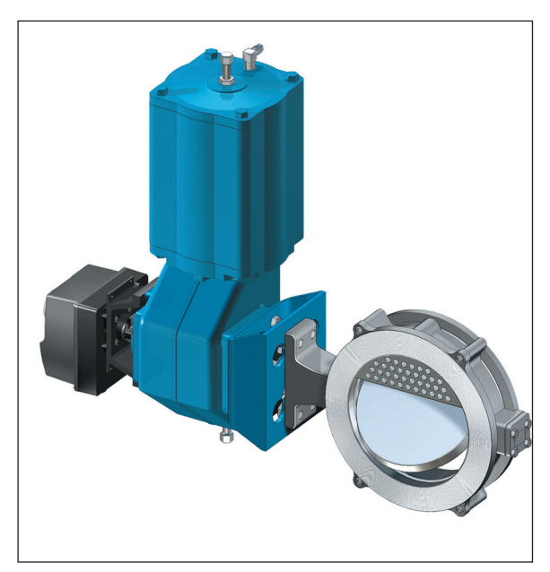
Metso Automation Neldisc triple eccentric disc with S-Disc® design