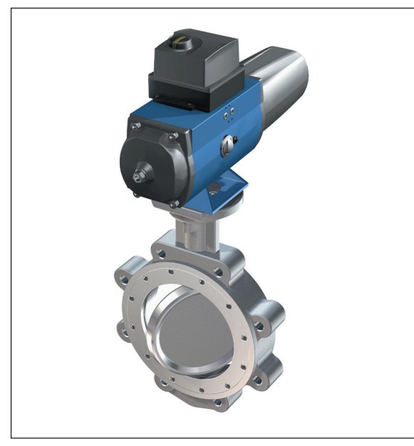
Metso Automation nelesCV Wafer-Sphere disc valve